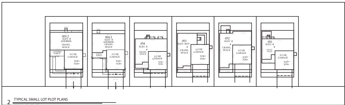
2 TYPICAL SMALL LOT PLOT PLANS