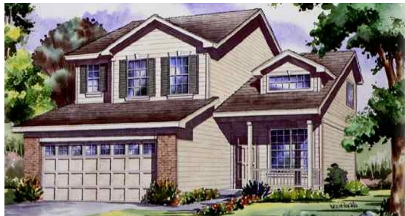
TYPICAL ELEVATION- 60'-70' WIDE LOTS

THIS DOCUMENT AND ITS CONTENTS ARE THE WORK PRODUCT AND PROPERTY OF WAY ARCHITECTS, P.C., WHICH RETAINS ALL COMMON LAW, STATUTORY AND OTHER RESERVED RIGHTS, INCLUDING THE COPYRIGHT.