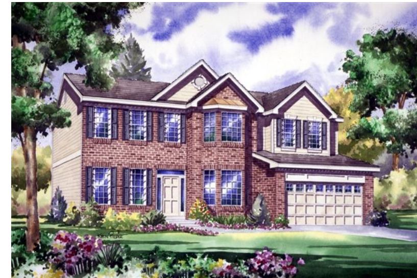
TYPICAL ELEVATION- 70'+ WIDE LOTS